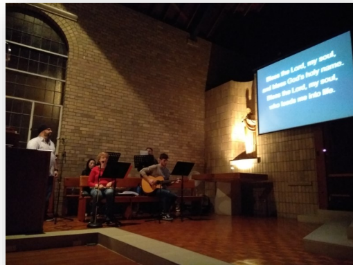
Pictures taken at our Taize evening held last Friday 12th April at OLHC Epping. L: Altar adorned with candles R: Musicians